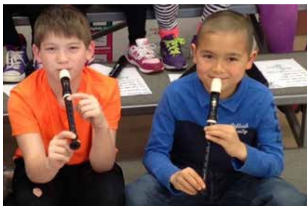
Elementary Recorder Students