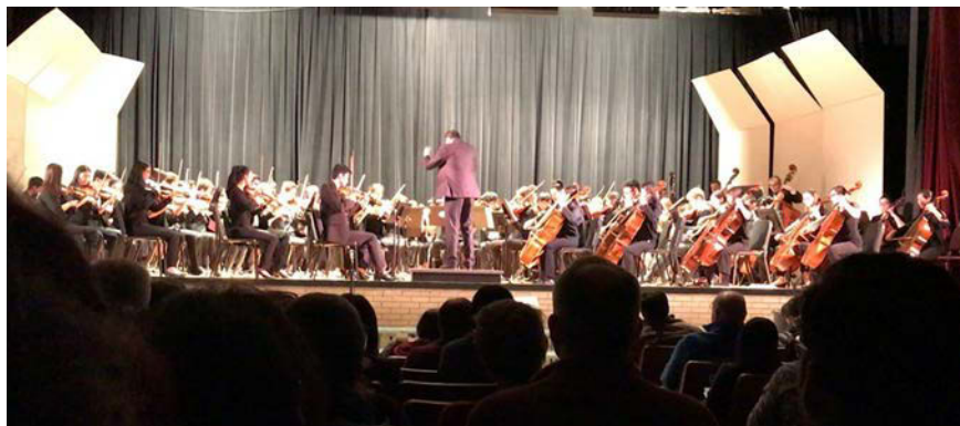
High School Symphony Orchestra