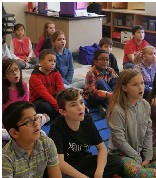
Hillside 4th grade students singing Together we can Change the World