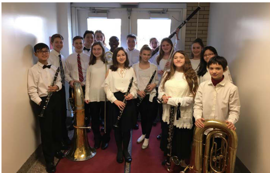
All County Band Performers