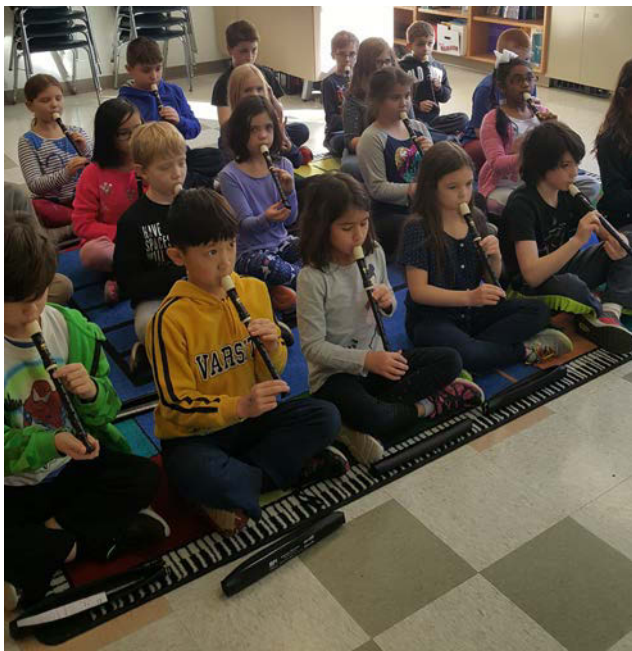
3rd grade Hillside students hard at work with their new recorders