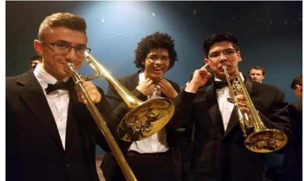
2017 District Band Festival

The role of Friends of Music is to provide outstanding opportunities for our students to excel with the guidance of our talented Nisky faculty.