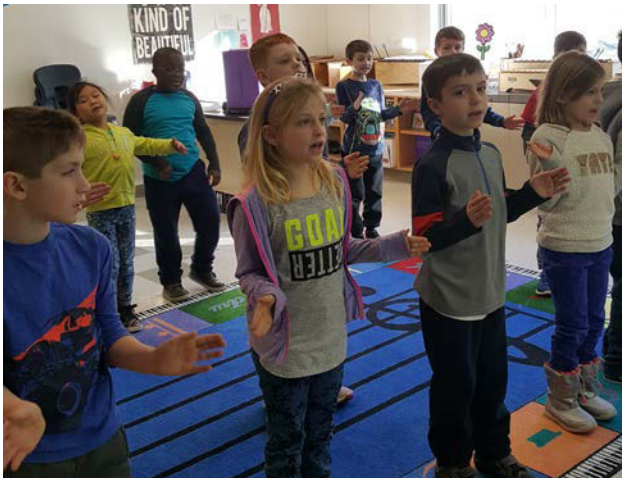
Hillside 2nd Grade Students working on their musical

Music education improves reasoning skills, memorization, imagination and discipline. Our students develop pride in their performance and achievement. They engage in self-expression, and are able to perform many genres of music, possibly encountering some new ones along the way. These are invaluable skills in making a successful student and a happy person.