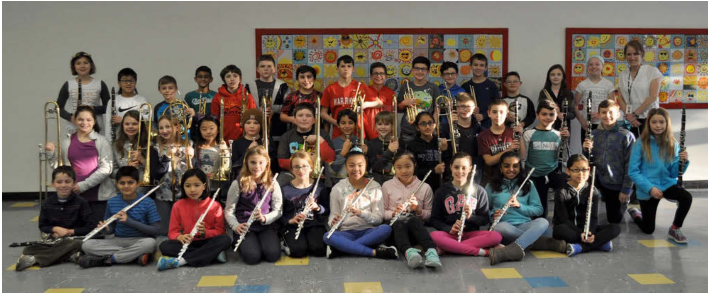
Rosendale 5th Grade Band

To conclude, we want to thank Friends of Music for their generous grant of $400 to Birchwood music for purchasing audio equipment for the music room and a boom mike stand to lead assemblies from the piano. Their interest and readiness to support the elementary music program is so encouraging!