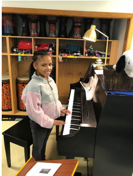
Fifth Grade Pianist at Birchwood

As we enter into the late fall and I write this, we are deep into the beginning of the school year and preparing for the holidays. I watch Facebook posts of fourth graders taking their first half size cello to begin their