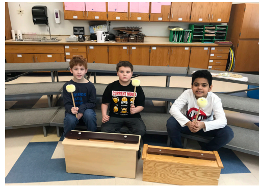
5th Graders at Hillside Enjoy Performing on a Variety Of instruments including our new xylophones