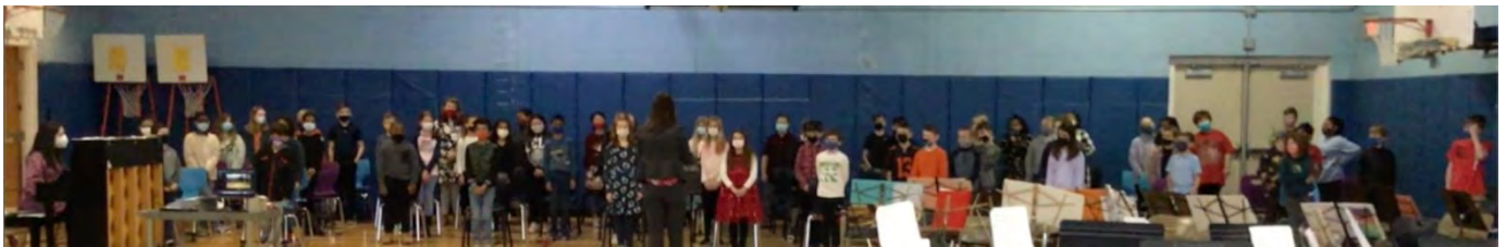
4 th Grade Chorus

The halls of Glenclyff were filled with music as students across the school joined together in the Winter Sing along and the January Good Morning Glenclyff. Students in 4 th and 5 th grade performed their concert in the gym, socially distanced. Their hard work really paid off; they have improved so much!