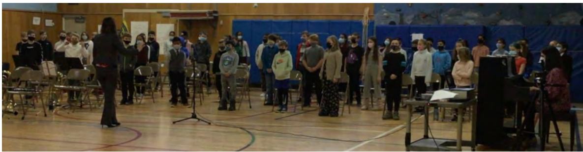
5 th Grade Chorus