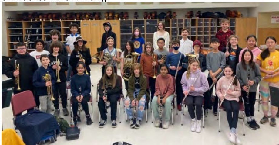
7 th Grade Band