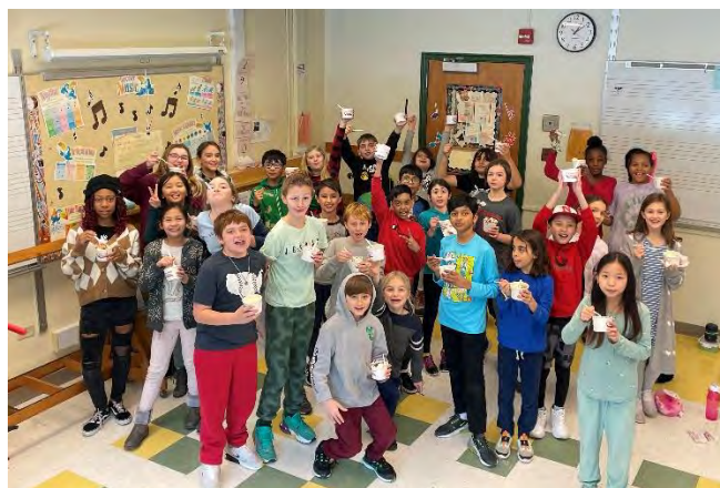
Craig Band Ice Cream Party