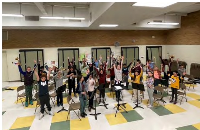
Craig Band at a Rehearsal

Craig Band students had a TERRIFIC assembly on January 25 th ! They have worked extremely hard and sounded wonderful after only a few short months on their instruments. We celebrated with an Ice Cream party and look very forward to our second and final concert in May. We will be bringing back a classic rock medley that the band premiered back in 2018. The Medley includes We Will Rock You , Crazy Train , Iron Man , and others!