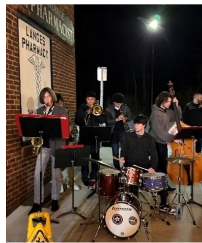
Jazz Combo Club