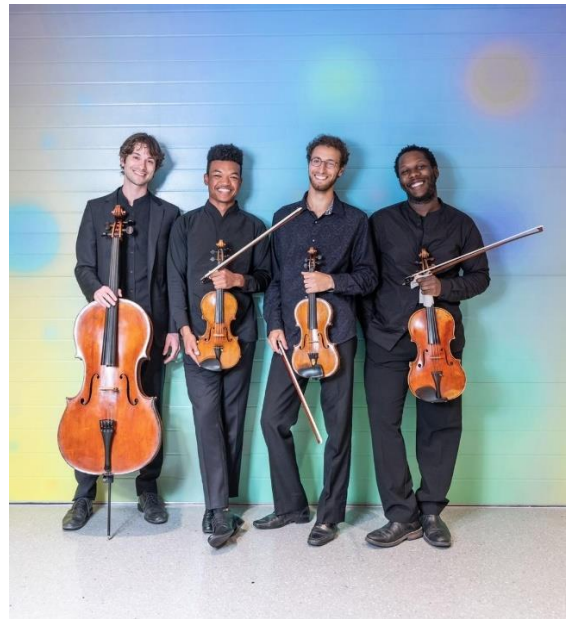
The Renaissance Quartet