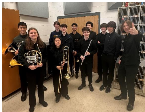
Band Students at All County