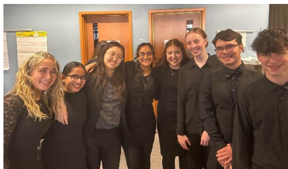
Area All-State Participants