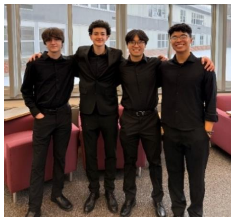
Suburban Council Honor Jazz Ensemble

In its pilot year of the Niskayuna Jazz Combo Club, the members are getting a taste of what it is like to be real gigging musicians. This student led and rehearsed group has performed at the Broken Inn and An Evening in History so far this year. On February 3 rd , the students will travel to the State Capital and perform at the NYS Museum at NYSUT's Legislative Reception. Students will perform for many of NY State Legislatures and possibly the Governor.